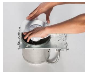
Step3: Insert LED trim.