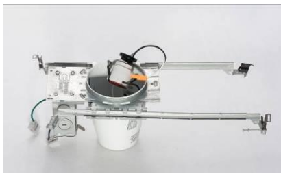
Step1: Twist adaptor into socket.